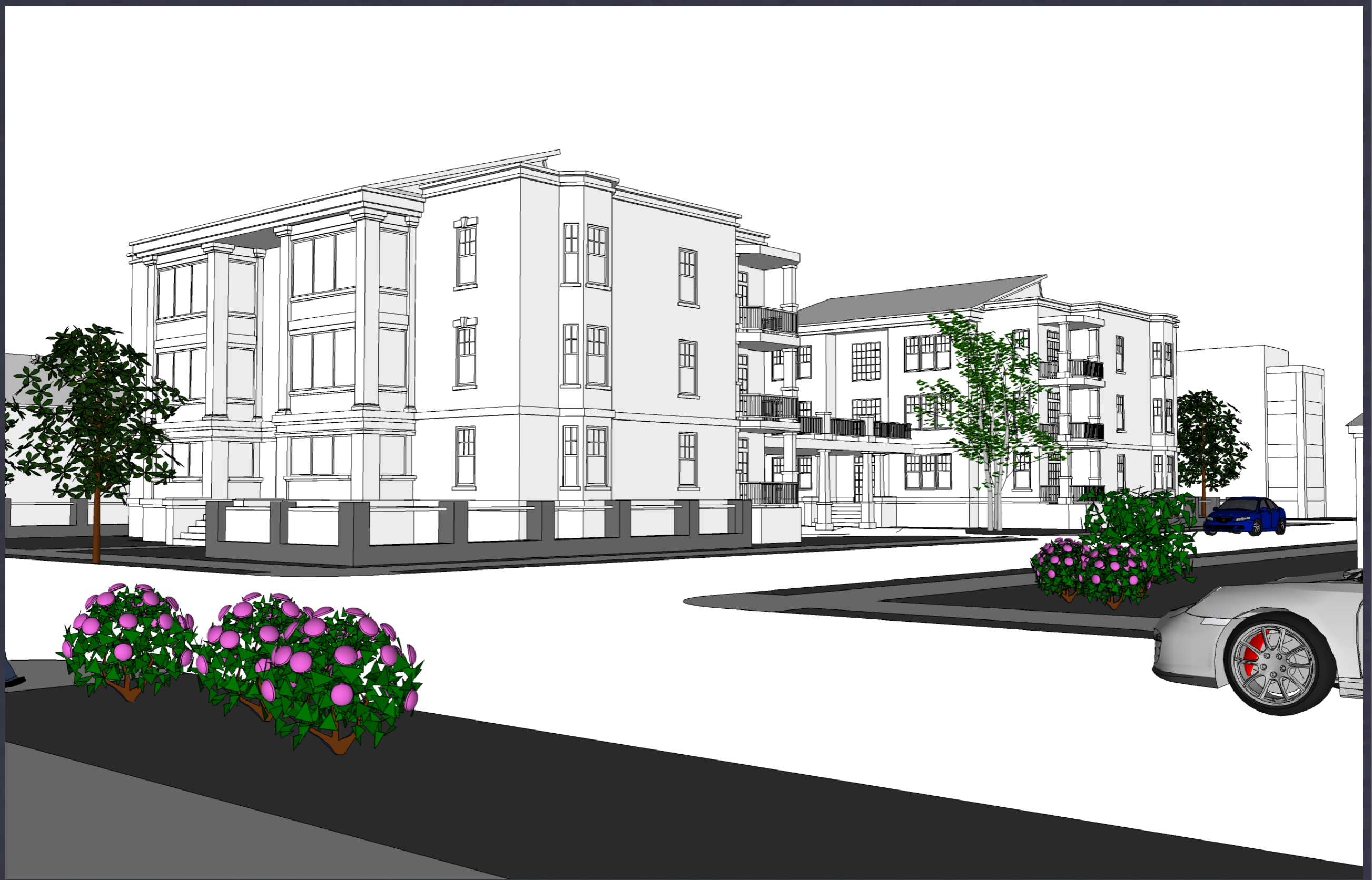
6 pack Colonial at 28th and at 27th Streets